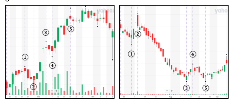
Figure 4 Graphical representation of Table 2