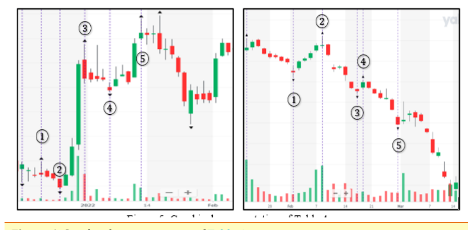
Figure 6 Graphical representation of Table 4