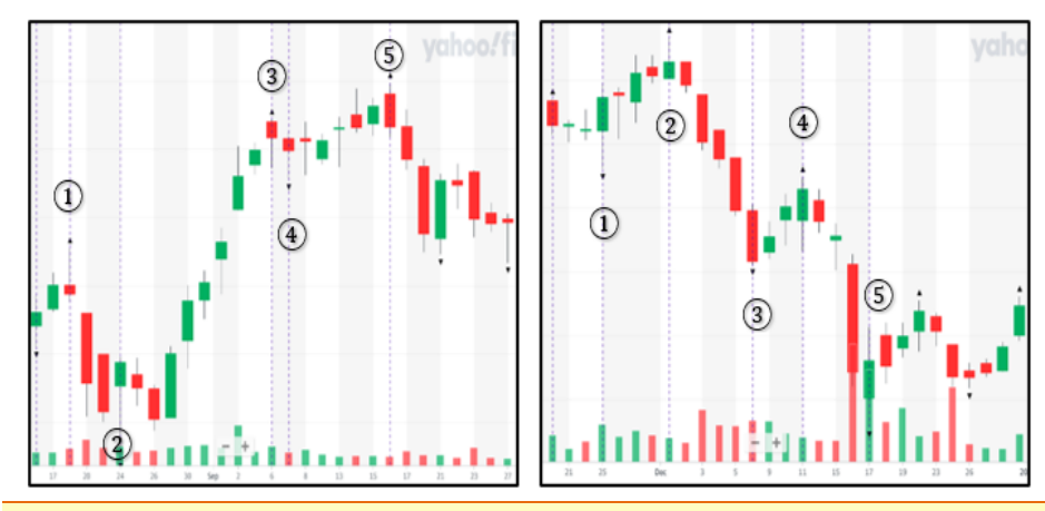
Figure 5 Graphical representation of Table 3