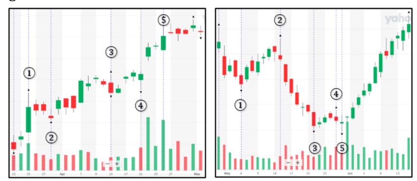
Figure 3 Graphical representation of Table 1