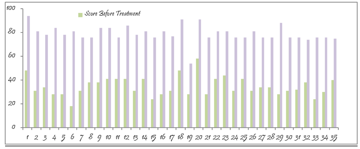
Figure 3: Formative assessment score – before and after treatment