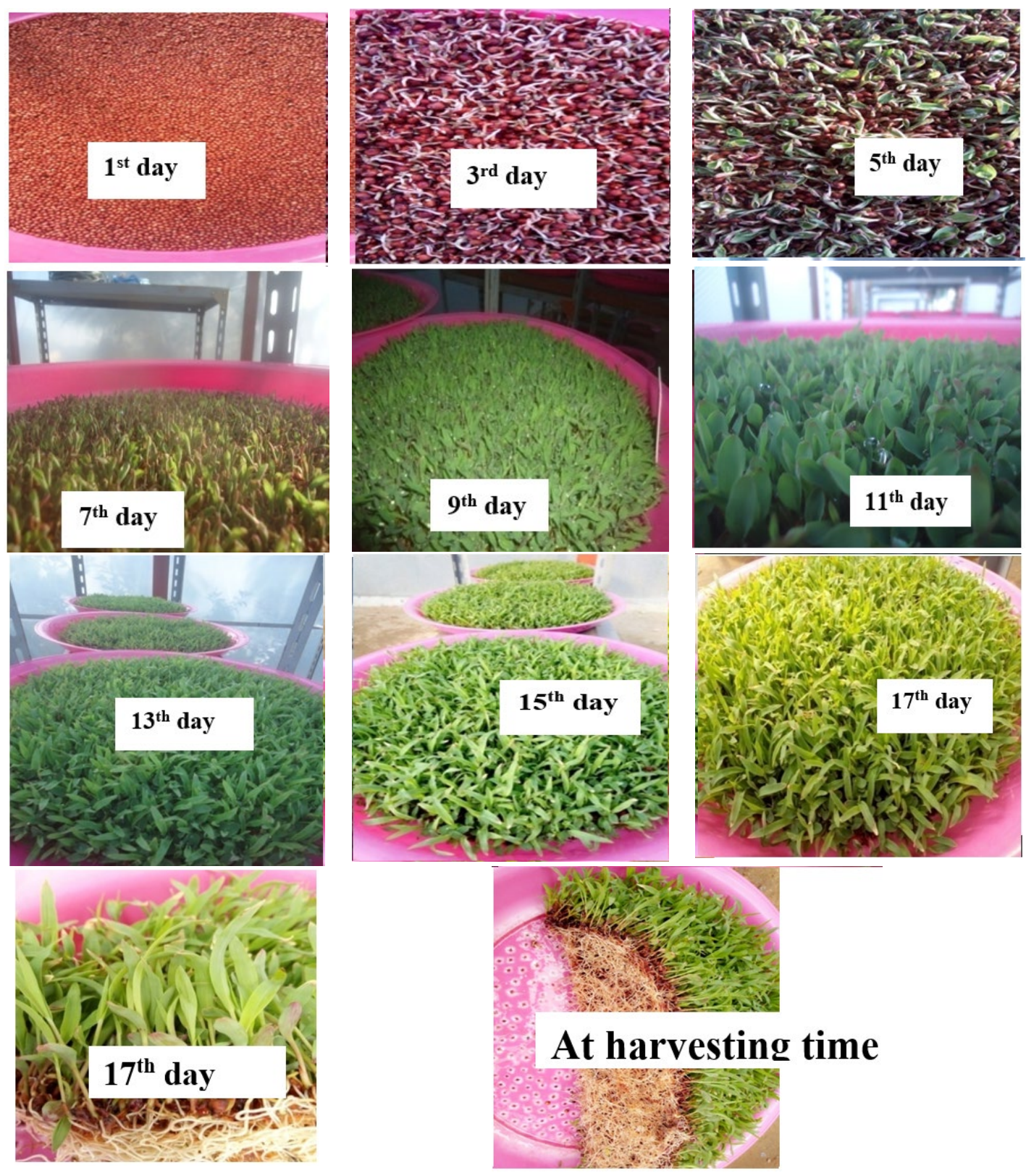
Figure 6: Hydroponic sorghum sprouts showing stages of growth from 1st day to 17th day

Since plant LRR is the ratio of plant leaf to plant root, as harvesting time increase the root weight decreases as compared to leaf weight and hence the plant harvested at 17th day have higher plant LRR.