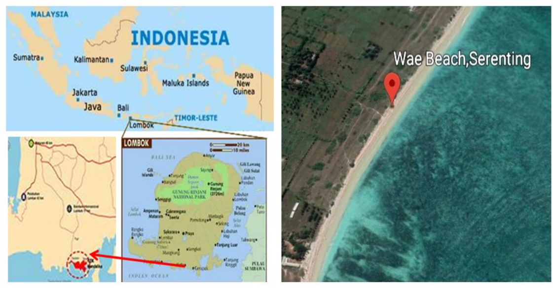
Figure 1: Research location on Serenting Beach (8°54'25"S 116°18'21" E); and the detected sites

Number of rainy days per month in MSEZ, Lombok Island ranges from 1 to 26 days with rainfall ranging from 0.4 mm to 448.3 mm. The research was conducted using the exploration method (roaming) at Serenting Beach, MSEZ, Central Lombok Regency. The research was carried out by listing the types of plants suitable for planting as a vegetation-based tsunami disaster mitigation effort on Serenting Beach. Identification of plant species refers to The Book of Flora [23] and the Guide to Introduction to Mangroves in Indonesia [24].