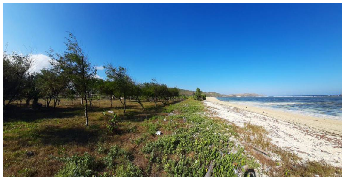
Figure 2 : Vegetation on Serenting Beach, Mandalika Special Economic Zone (MSEZ) International Journal of Research -GRANTHAALAYAH

The southern coast of Lombok Island, such as Serenting Beach, MSEZ, is an open sea which directly faces the Indian Ocean. Serenting Beach faces various problems such as unplanned development, population growth, and various impacts of global climate change and is vulnerable to disasters such as tsunamis.