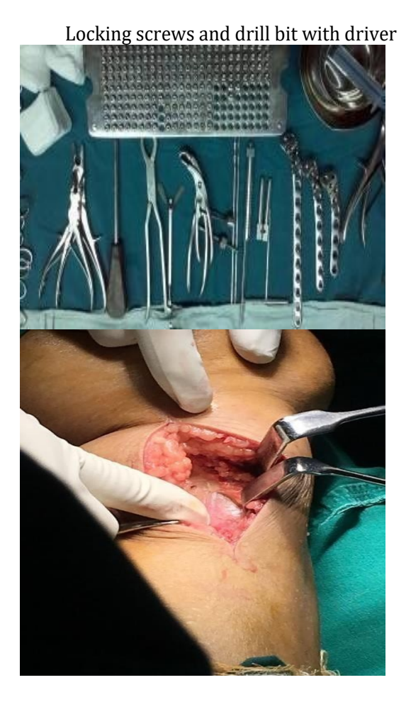
Open Reduction and Application Plate