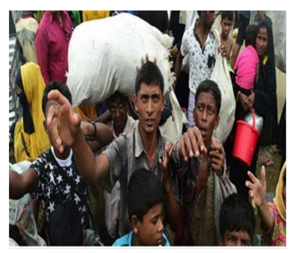
Figure 3: Rohingya Refugee