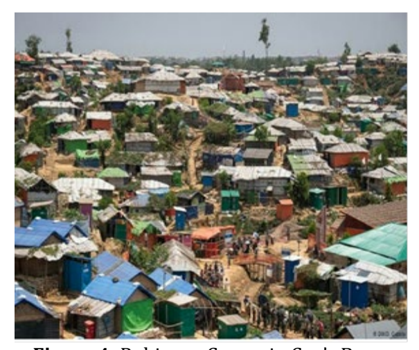
Figure 4: Rohingya Camps in Cox's Bazar