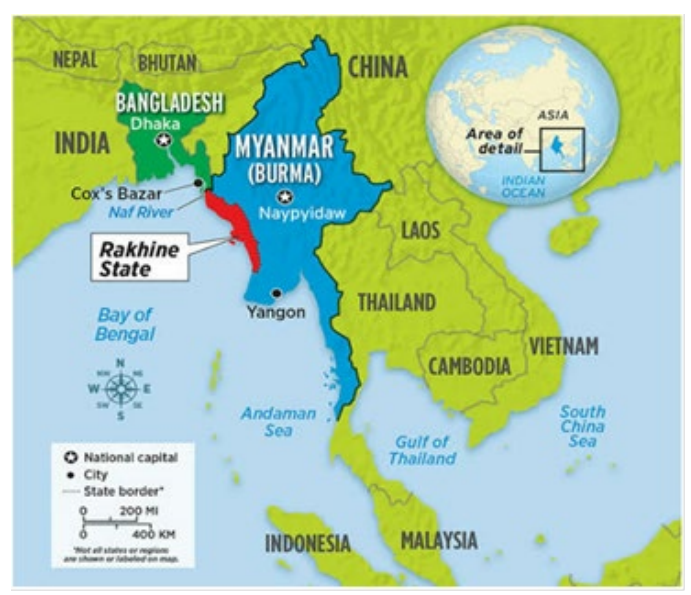
Figure 2: Location map of Rakhine state and Cox's Bazar