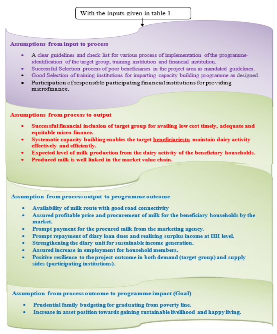
Figure 2: Assumptions in the causal pathways

An attempt has, therefore, been made in this section to critically map the convolution round the theory of change based on the evaluative findings drawn from the secondary data on the