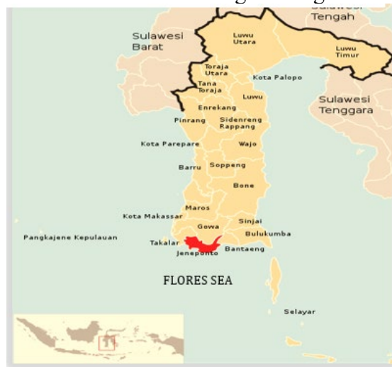
Figure 1: Map of research location

Stations are conceptually determined and stations are determined based on coordinates using GPS. Determination of the station point is determined from the mangrove vegetation closest to the mainland.