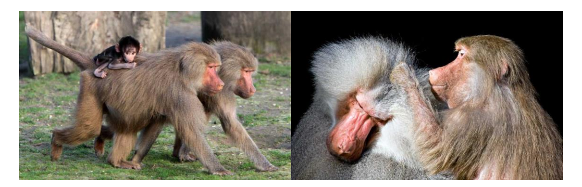
Figure 1: Baboon in forest