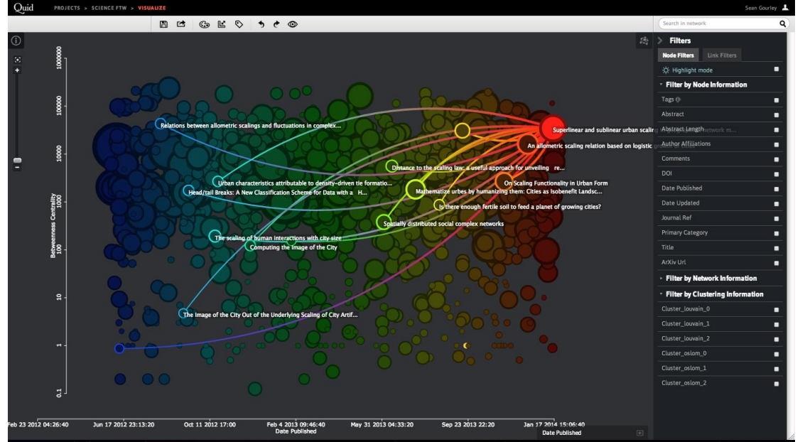
Figure 1: A physics engine is applied to streams of unstructured data filtered through the Quid analytics system to obtain spatial resolution of trends in data.

are filtered through the Quid analytics system. Applying a physic engine to obtain spatial resolution, the Quid Intelligence Platform creates visualizations that connect data and information from disparate resources. Quid AI software produces data landscapes (Figure 3.3) to make complex problems comprehensible for investors and innovative companies (Clegg, 2015). As these technologies are optimized for engineering fusion applications, strategic managers that utilize data landscapes like Quid will remain ahead of competitors.