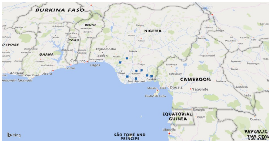
Figure 1 Map showing the capital cities in the Niger Delta, Nigeria

The coordinates of the capital cities of the Nigeria's Niger Delta, according to Chineke and Idinoba (2011) include, Akure 1 (lat.5.20E, long.7.25N), Asaba 2 (lat.6.18E, long.6.75N), Benin 3 (lat.5.60E, long.6.32N), Calabar 4 (lat.8.32E, long.4.95N), Owerri 5 (lat.7.02E, long.5.48N), PortHarcourt 6 (lat.7.00E, long.4.75N), Umuahia 7 (lat.7.48E, long.5.53N), Uyo 8 (lat.7.93E, long.5.05N), and Yenagoa 9 (lat.6.26E, long.4.92N). From the obtained coordinates listed, travel routes can be shown between the cities ( Figure 1 ).