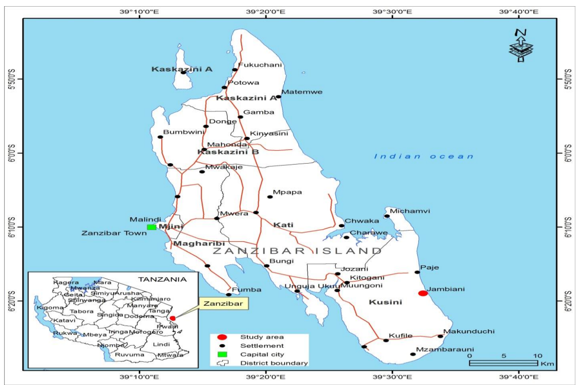
Figure 1: A map of Unguja Island showing location of study area.

S06°19.263' E039°32.936'. Tropical climate characterized by bimodal rainfall; dominates the area, receiving 1300 and 1700 mm of rainfall per year. The long rains fall between March and May estimated to range between 900 mm and 1200 mm, and short rains fall between October and December, estimated to 400 mm and 500 mm while the dry season dominates between June to September. The mean annual maximum and minimum temperature is 29°C and 21°C respectively, characterized by fairly constant average temperatures across the year (MANRLF, 2016).