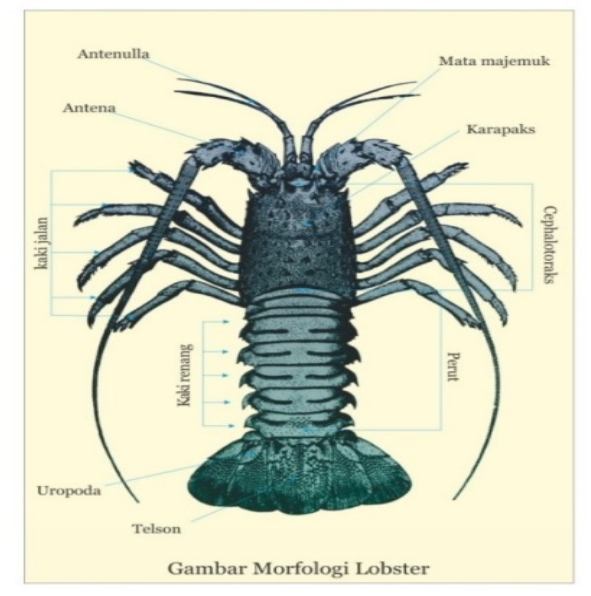
Figure 1: An example of a fresh display of lobster Panulirus sp.

As the research target animal is crayfish ( Panulirus spp) obtained from the catch of fishermen operating around Spermonde waters using bottom nets, bottom traps, and by diving. Examples of caught lobsters were preserved with formaldehyde [10] in a jar (25cm diameter, 40cm high). Shrimp length is measured with a 0.1cm ruler (Fig. 1).