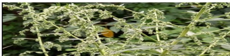
Plate 1. Flowering meristem of Artemisia nilagirica (Clarke) pamp

Table 2 and Fig 1; confirms the root protein's molecular weight (k) of the different okra plants, with both the treatments of high diluted ayurvedic-biomedicines; Artemisia nilagirica -extract, at extremely low doses, on Root-Knot disease, and Yellow Vein Mosaic Virus (YVMV) and Okra Enation Leaf Curl Virus (OELCV) foliar diseases of okra plants, and the root proteins of all groups confirmed by the increased number of proteins in the roots again; the lowest number of protein is 11 in the uninoculated untreated roots and highest number of proteins, are 18 in the pretreated- and 16 in the post-treated- ayurvedic-biomedicines; Artemisia nilagirica -extract, roots respectively again (Table 2 and Fig. 1). It is also confirmed that 280k (280,000kDa) is the highest molecular weight protein, and 11k (11,000kDa) is the lowest molecular weight protein. Four is the lowest number of the new pathogenesis-related protein (PR-proteins) in the uninoculated untreated roots, and 15 and 14 are the highest number of the new pathogenesis-related proteins (PR-proteins) in the pretreated- and post-treated- ayurvedic-biomedicines; Artemisia nilagirica -extract, roots respectively again (Table 2 and Fig. 1), and 14 is in the PR-proteins of inoculated untreated one again (Table 2 and Fig. 1).