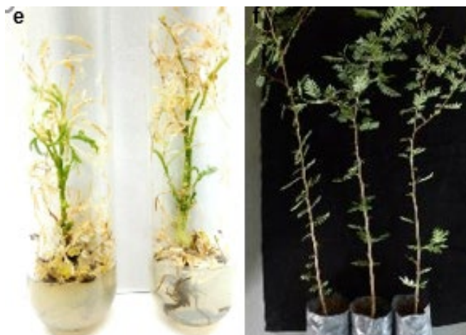
Figure 1: e. In vitro plants stored for more than a year, showing strong defoliation, and f. Plants acclimatization