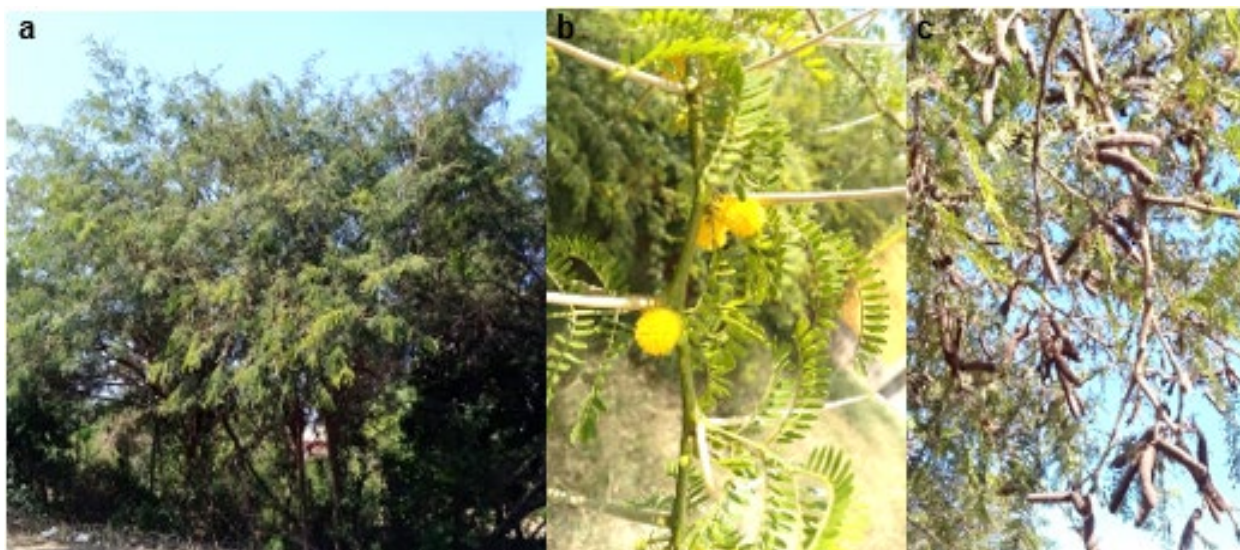
Figure 1: Plant propagation and germplasm conservation of Vachellia macracantha (faique). a. Adult plants used as a living fence, b. Branches with flowers, c. Branches with fruits

Three to five-old plants, on natural field conditions, were selected from located near Motupe–Olmos (Lambayeque, Peru) (Figure 1a, b and c). The shoot tip and nodal segment explants 50 mm were taken from the non-lignified part of young branches. All the leaves were removed, then the explants were dipped for 10 min and agitated in detergent solution and then in 0.2% Orthocide for 30 min. Subsequently the explants were surface-sterilized in 70% ethanol for 1 min and 5% commercial sodium hypochlorite solution (Clorox®) for 5 min before being rinsed three times in sterillized distilled water. The shoot and node segments were then cut in uninodal microcuttings of 10 to 15 mm in lenght and aseptically introduced into test tubes (18x150 mm) containing the culture medium. The same method was used on the micropropagation process.