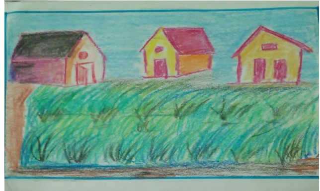
Figure 5: Painting by students