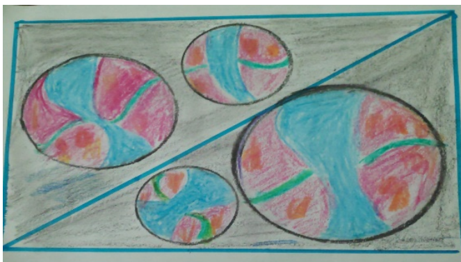
Figure 2: Painting by students

The example of the second student is about the shells on the beach, some of which are hidden by a ball. Written equation gives answer to the question: “How many shells are under ball? To check the answer ball is lifted up and the answer it is displayed.