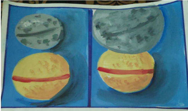
Figure 4: Painting by students

Story 2: Second student is shown the story of farm. There are three hens. Each hen has three sheep. Each sheep has three lamps. This story represents power of 3.