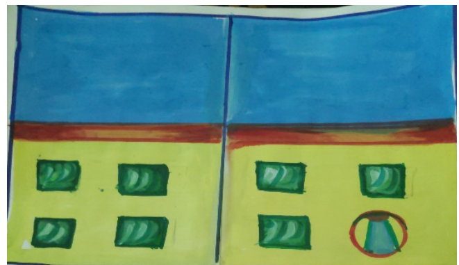
Figure 3: Painting by students