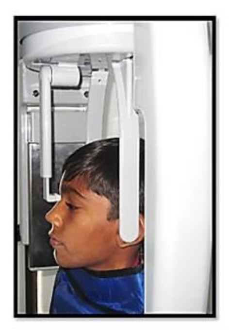
Figure 3b: Profile view of subject positioned in cephalostat