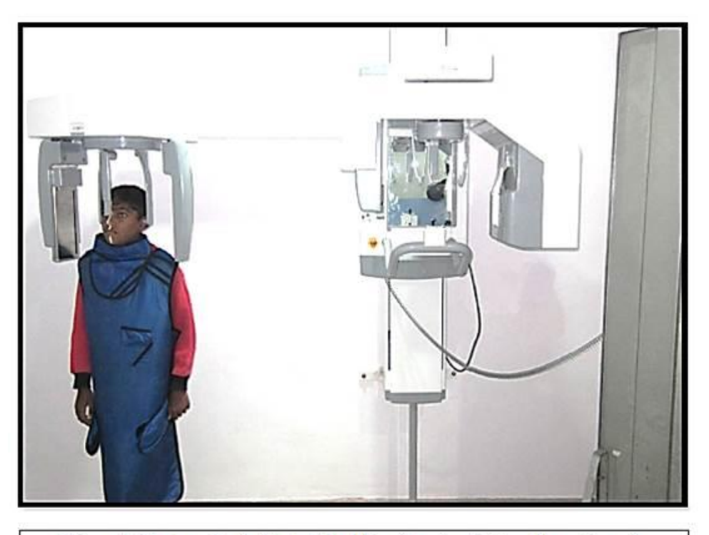
Figure 4: Photograph of subject while taking lateral cephalometric radiograph