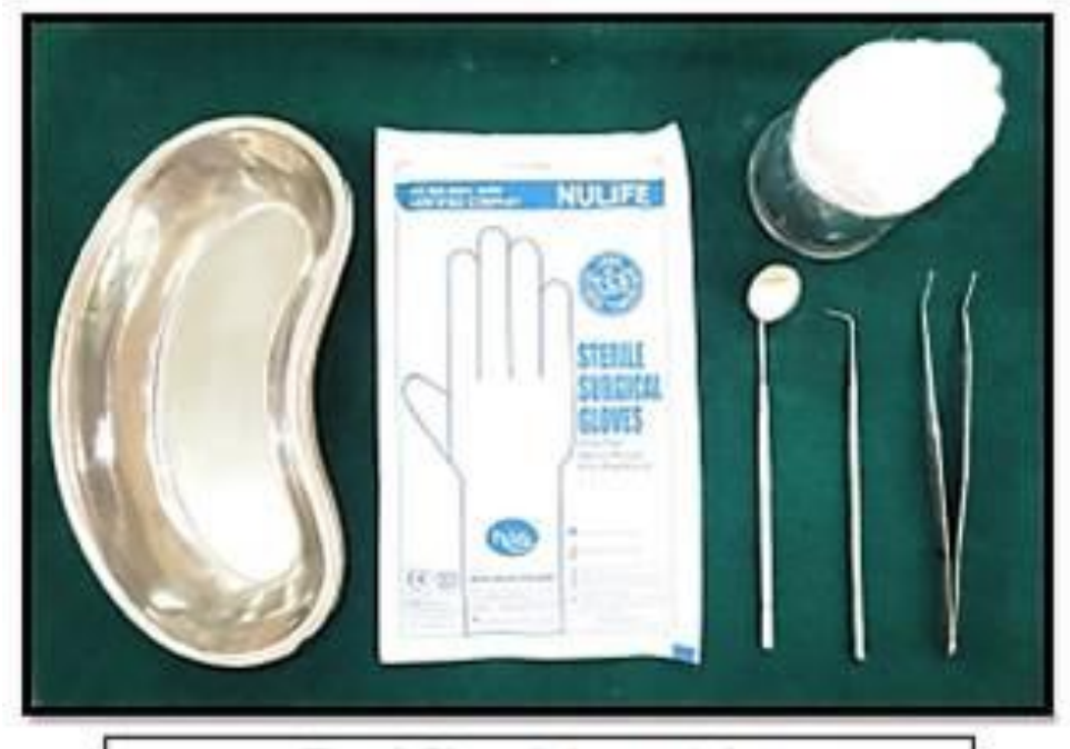
Figure 1: Diagnostic Armamentarium