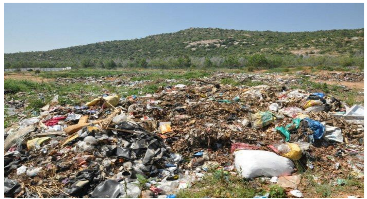
Figure 1: Untreated waste in urban areas

adopted. In this paper, we have proposed an IoT based smart waste management system that keeps a check on the waste management in cities.