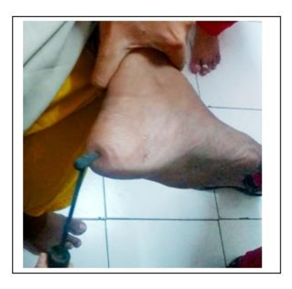
agnikarma given on pad pradeshi