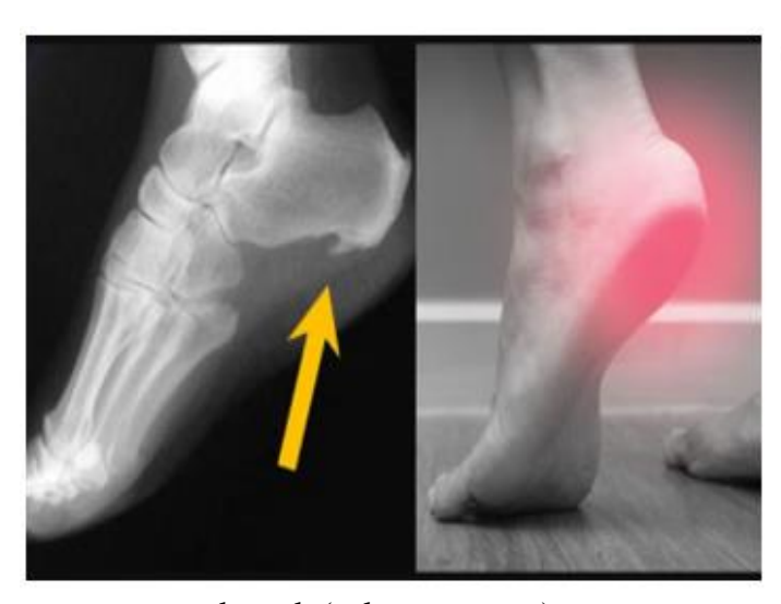
vatkantak (calcaneun spur)