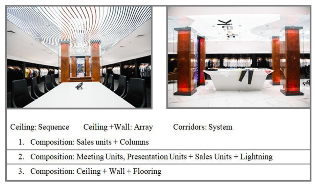
Figure 6: Store overview

When we continue to read the picture, it is seen that the walls characterize "string", the "gray wall" and "white marble" are combined and characterize "sequence". Based on these data, it constitutes the "system" in which two different architectural elements such as "gray wall" and "white marble" interact. In this context, the "denotation" layer in the message of the white marble is the "carrier", however the "connotation" layer is "transition from old period to modern life".