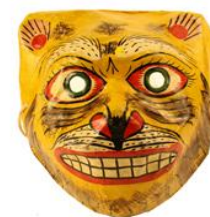
Lion Mask, Papier-Mâché

All masks have some elements and principles of design. They serve multiple functions as they are the functional art form. Mask are made by wood, paper maiche, a few are made of wrought iron. 22 Leather, bones, shells, beads, fibers, human or animal hairs and feather is also used 23 Tribal of Madhya Pradesh make carved wooden mask of animals and insects. Maria tribes used the wooden mask with bison horns in red coloured. Mukhada or mask is made of pumpkin or guard skin, waste paper, wood and card board, pumpkin seeds is used to make the teeth. Moustaches and beard are made by the hairs of goats or bears. Mouth nose and ears are made honey bee wax. For decoration aluminum foil, gloss paper, feather of birds or peacock are used. 24 The craftsman of Purulia, West Bengal make wooden mask for Chhau dance. In Nepal, wood is used to make mask. Mask could be made by single piece of wood or it can be mechanical with movable parts as the eyes open and shut. Brass and Zari is used for making Ramlila Mask. Stalks of areca nut fronds are used to make Kolam. These perishable masks are painted with natural colours viz turmeric fruits and vegetable dyes. 25