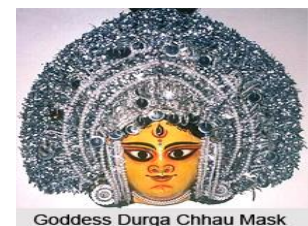
Goddess Durga Chhau Mask

In India, the festival masks are used to represent the deities and mythological characters. It is believed that mask is related with the ancestor cult. In different parts of the country, the rich tradition of Mask has distinct quality. They are usually formalized and highly exaggerated with aesthetic values. The Impact of Vaishnavism, Shaivism-Shakti cult and Buddhism reflects in various part of Indian culture.