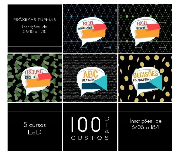
Figure 5: Set of images for for visual communication in social media

With greater interactivity the student enjoys more dynamism in learning, since all the platforms were developed in order to offer the best experience for him. It is possible to access the teaching material through a cell, tablet or computer screen. No matter the medium, the student has the best material available, because it was designed for all dimensions and designed so that it does not make the reading tiresome, nor that the colors used bring conflict with the information inserted.