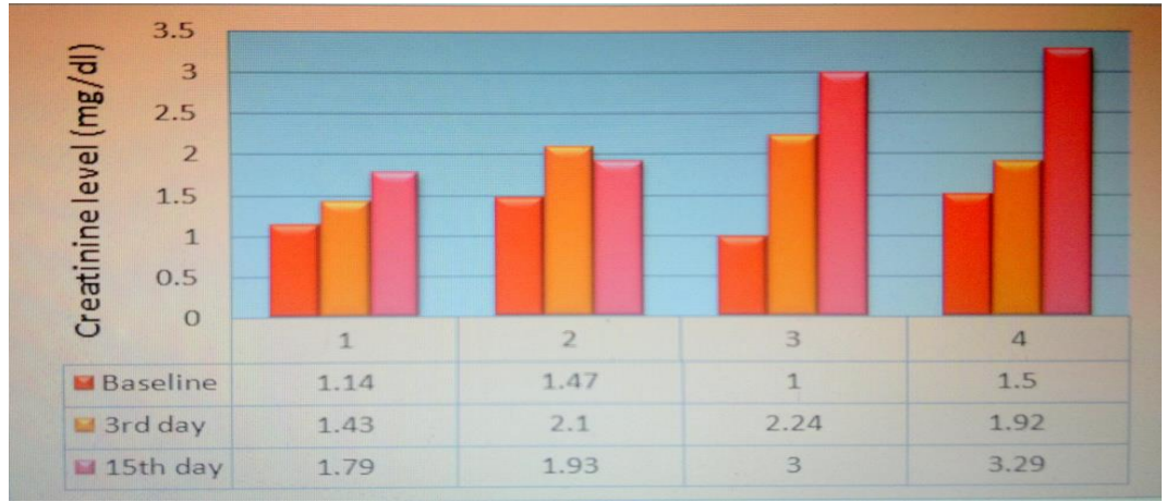
Figure 1: Graphical presentation of the Creatinine level before surgery and on the 3<sup>rd</sup> and 15<sup>th</sup> post – operative day.

Statistical analysis revealed a significant increase of creatinine level regardless of animal's age after unilateral nephrectomy on its 3<sup>rd</sup> post – operative day up to 15 days post – surgery. No significant difference was seen between the two groups of experimental animals under study all of which have almost the same result.