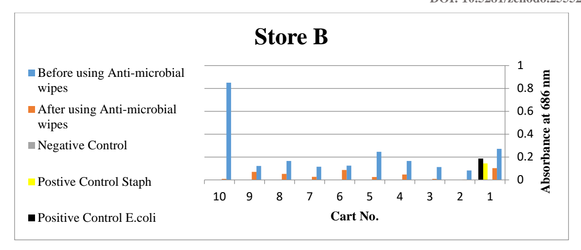
Figure 2: Store B, shows the amount of bacteria in each cart before and after using antimicrobial wipes. Results of the data shows that when wiping the carts with antimicrobial wipes it is registered as negative values which means the amount of bacteria will be less comparing with the carts that doesn't wipe with antimicrobial wipes. Negative control refers to sample containing a sterile swab and nutrient broth that was incubated for 24 hours at 37°C. Positive controls refers to staph and E.coli sample each inoculated in nutrient broth and incubated for 24 hours at 37°C. samples were measured using spectrophotometer at 686 nm absorbency.

Table 2: Show number of bacteria/ml in each cart before and after using antimicrobial wipes.