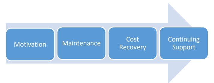
Figure 2.2: The Sustainability Chain, Carter et al 1999

Sustainability pertains to multiple aspects of a rural water supply, with institutional, social, technical, environmental and financial dimensions (WELL, 1998). This accounts for the fact that understanding and measuring sustainability is so difficult, and why solutions are highly context specific. Conceptual frameworks, such as the one below, have been developed to capture the inter-linkages that relate to sustainability, a weakness in anyone of which can lead to failure of the scheme.