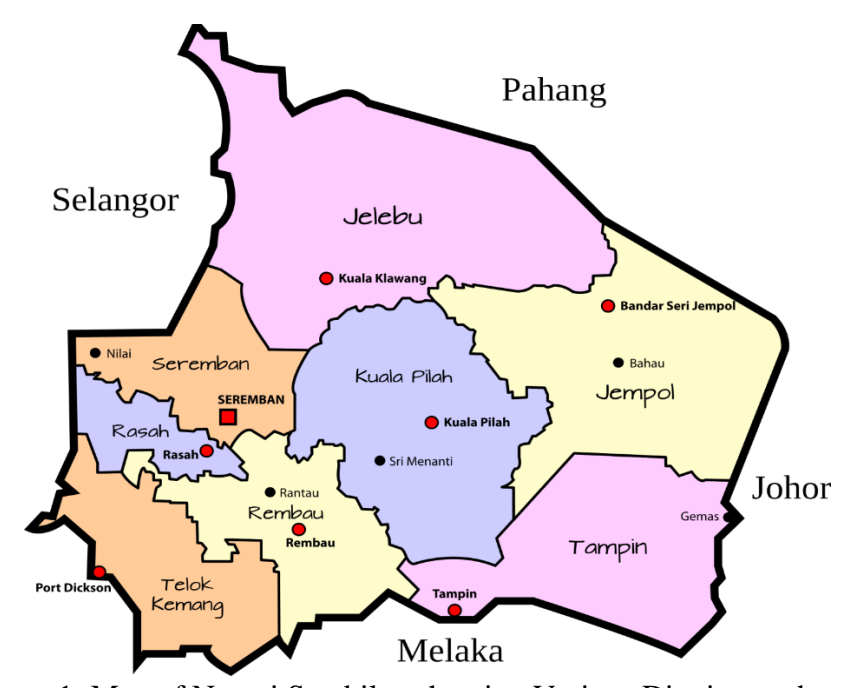
Figure 1: Map of Negeri Sembilan showing Various Districts and towns

Below is a comprehensive map of Negeri Sembilan State where the research work was carried out.