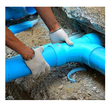
Easy to Install and Maintain: plastics can be installed easily with less requirements of management and impenetrable. They are light in weight and their flexibility enables the possibility of soil movements in plastic pipes.

Innovation: Plastics have become an inspiration for architects to design innovative buildings, creative features and dimensions. The rapid advancement in plastics innovation have been found helpful in cost reduction and increment in the quality of buildings.