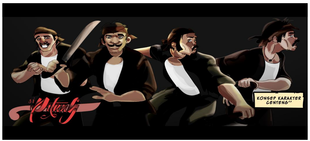
Figure 3.8: character Dutch port Ilustration by Nico Sandjaya

The character depicted in a typical Dutch royal army dress is pinned for gray trousers plus commando stick and ruthless and cruel expression.