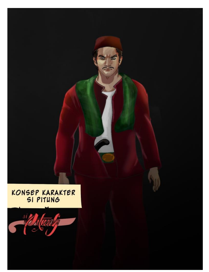
Figure 3.5: character of the Pitung Ilustration by Nico Sandjaya

The logo of the pitung in this digital comic focuses comic concept focused on the age of the students, whose purpose is to invite the students to watch the comics made by the children of their own country. On the basis of the segmentation, the author makes a slightly interesting logotype. The font is designed like handwriting and red colored. The red color here symbolized by one of the bold Pitung's character, red font and color is also designed to get the impression of exclusive and elegant because it is shown for the age of over 15 years. To add to the masculine impression of the figure of Pitung.