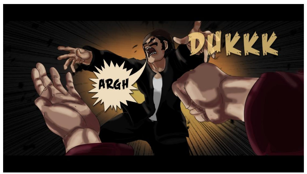
Figure 3.2: Rescue Si Pitung fight with a mask Ilustration byNico Sandjaya

Illustrations in the illustrations can be seen clearly the character of the Pitung as a champion or whiz with just memperliatkan fist picture so sturdy that drawings that Si Pitung is a knight always defend the society cannot afford. Detailed hand drawings and then mimic the character of the villain has a very perfect whiz.