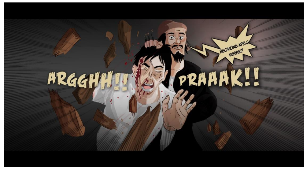
Figure 3.1: Fighting scenes Ilustration by Nico Sandjaya

Illustration In a fight with the martial arts of pencak silat, the characters or mimic in the illustration with the head restrained with the blood tetesa. Sentences that are made very precise by adding a sentence that menyatak kesaikitan. Plus the effect of the image that gives the impression looks i pitung a hero