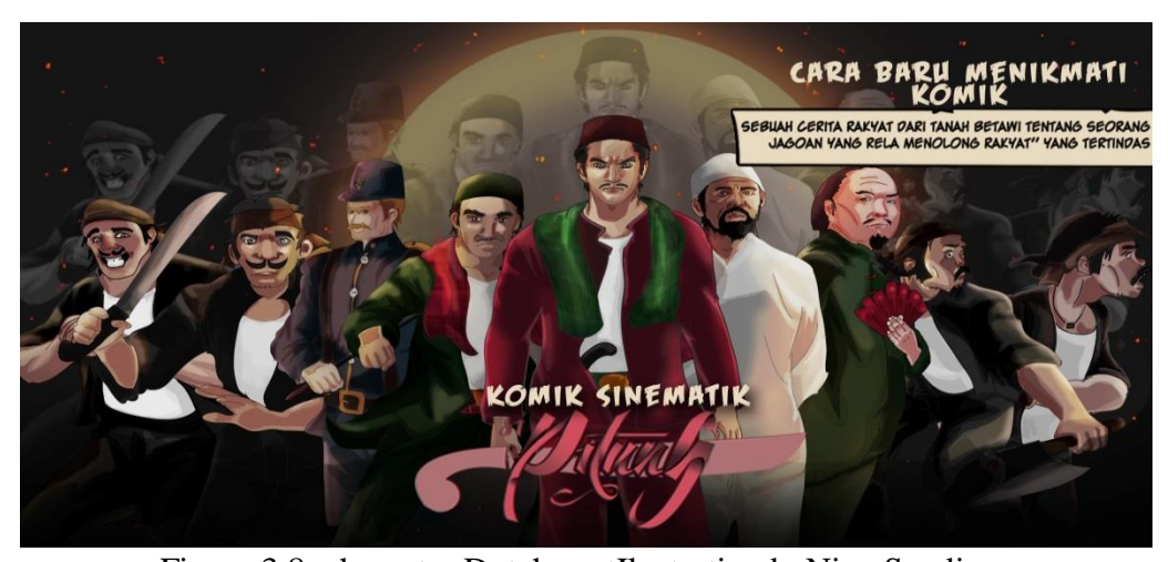
Figure 3.8: character Dutch portIlustration byNico Sandjaya

The other antagonists are the centengs. Actually the centeng-centeng is a champion-martial arts master with great ability. The jawara were usually hired at high prices by the landlords or by the Dutch government. The inhabitants also believe that the champions possess immune sciences and so on, so it is feared by the inhabitants. They are identical with black-colored outfits, with ghostly looks, even bias and expert and use sharp weapons like machetes, axes.