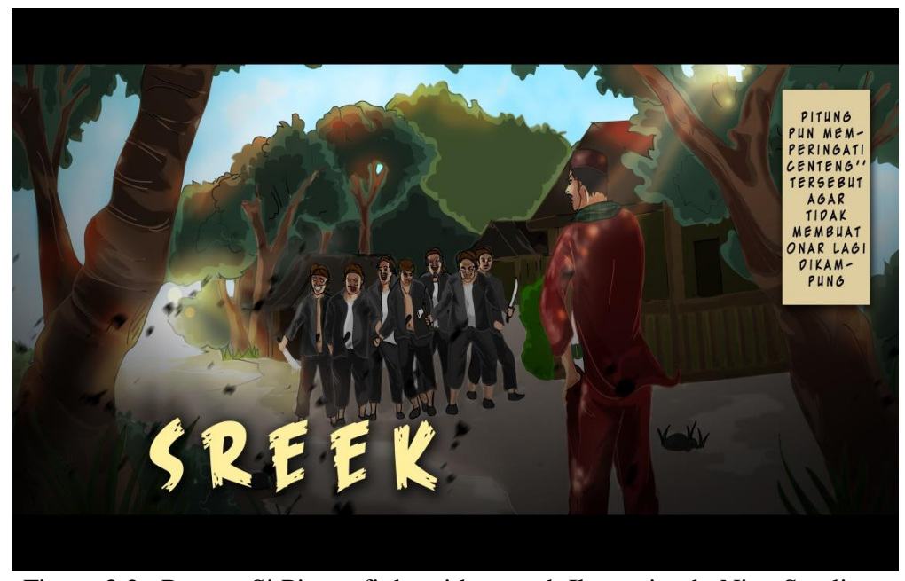
Figure 3.2: Rescue Si Pitung fight with a mask Ilustration byNico Sandjaya

Illustrations in the illustrations can be seen clearly the character of the Pitung as a champion or whiz with just memperliatkan fist picture so sturdy that drawings that Si Pitung is a knight always defend the society cannot afford. Detailed hand drawings and then mimic the character of the villain has a very perfect whiz.