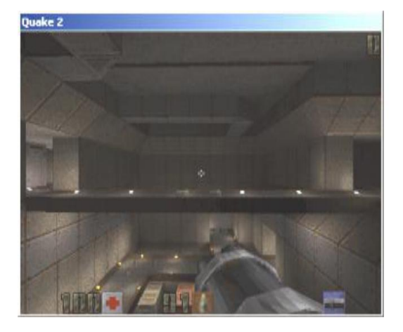
Figure 5: Agent- at the dead end