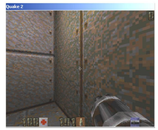
Figure 1: Quake server- game environment