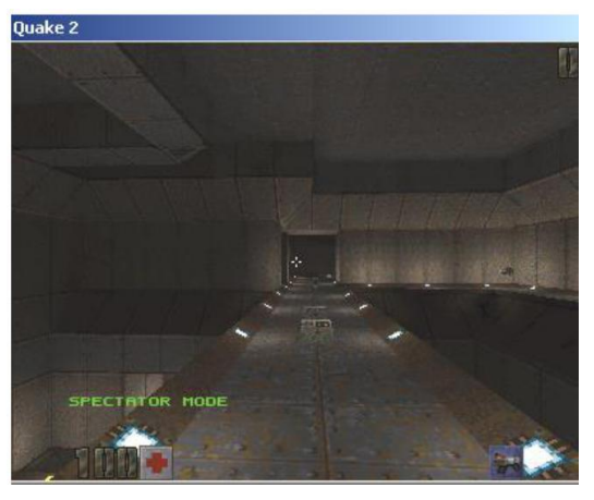
Figure 6: Agent- environment scan