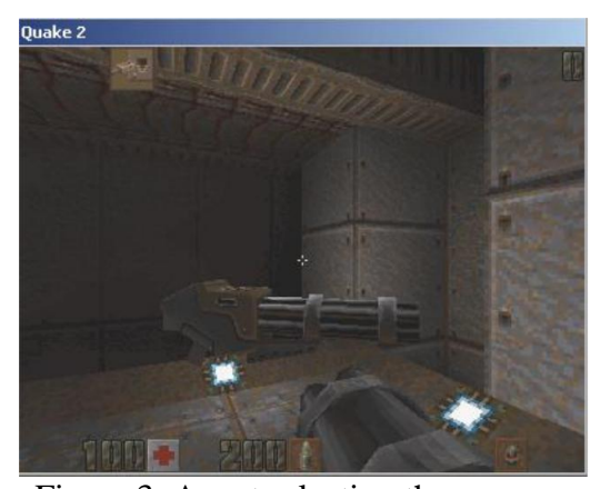
Figure 3: Agent selecting the weapon