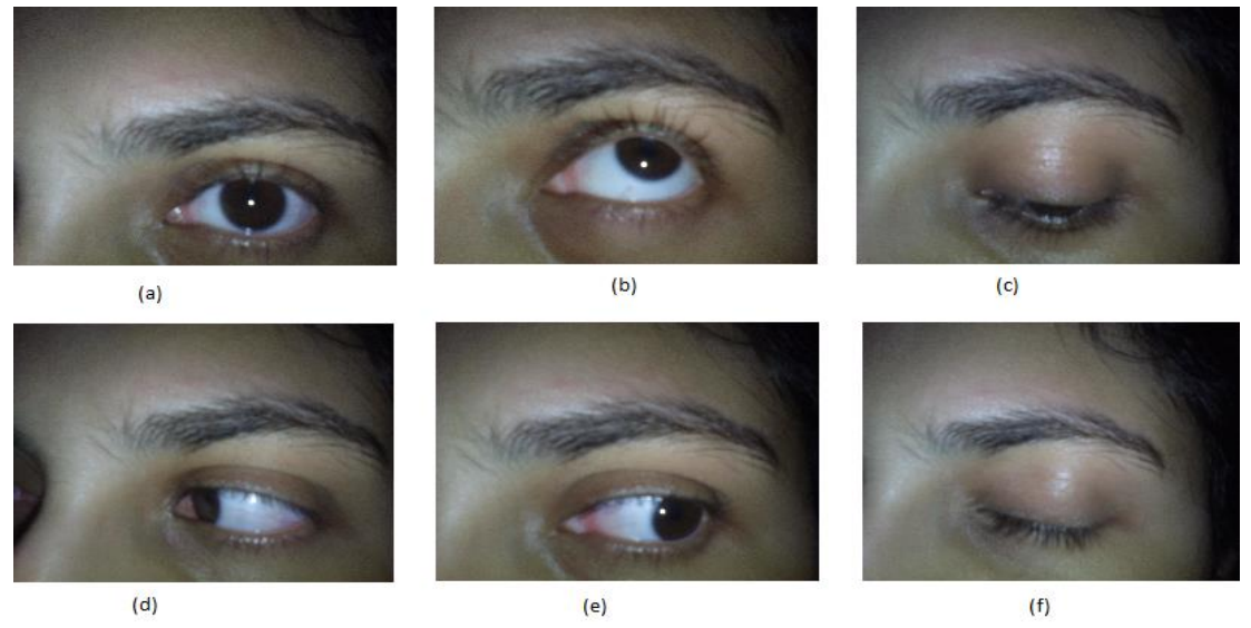
Figure 3: Sample image of one eye, (a) forward gaze, (b) upward gaze, (c) Downward gaze, (d) rightward gaze, (e) leftward gaze, (f) closed eye.

The proposed system has been developed and experimented with a prototype of wheelchair. The camera was set about 50cm apart from the eye. In order to capture image of only one eye, the camera zoom capability used is 4X.the camera was at about height from the handle of the chair. The height of camera can be adjusted according to the height of the person .various controls to wheelchair were given using eye tracking of multiple users to determine the accuracy of proposed approach and the result .the proposed algorithm provides 81.2% accurate estimation on average which is satisfactory considering it is computationally lighter and so suitable for intended real-time applications. The accuracy could be more if we could use real disabled persons.