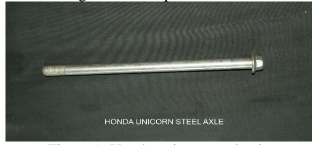
Figure 1: Honda unicorn steel axle

The steel used in the current axle of Unicorn vehicle of honda company. The strength is the most important matter in the axle and weight is also important fact of the vehicle parts.