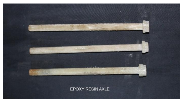
Figure 2: Epoxy resin axle

Epoxy resin is also compatible material in modern mechanical parts. It was also taken in the study.