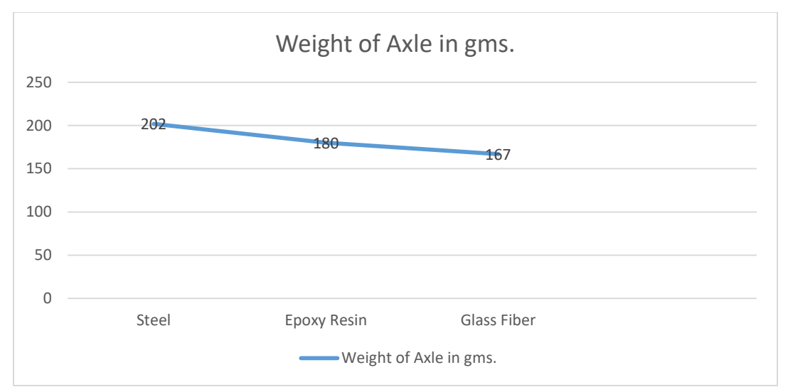
Graph 1: Weight of axle in grams

The below graph shows the weight of axles in gms.