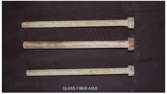
Figure 3: Glass fiber axle

Glass fiber is a material consisting of numerous extremely fine fibers of glass. Glassmakers throughout history have experimented with glass fibers, but mass manufacture of glass fiber was only made possible with the invention of finer machine tooling.