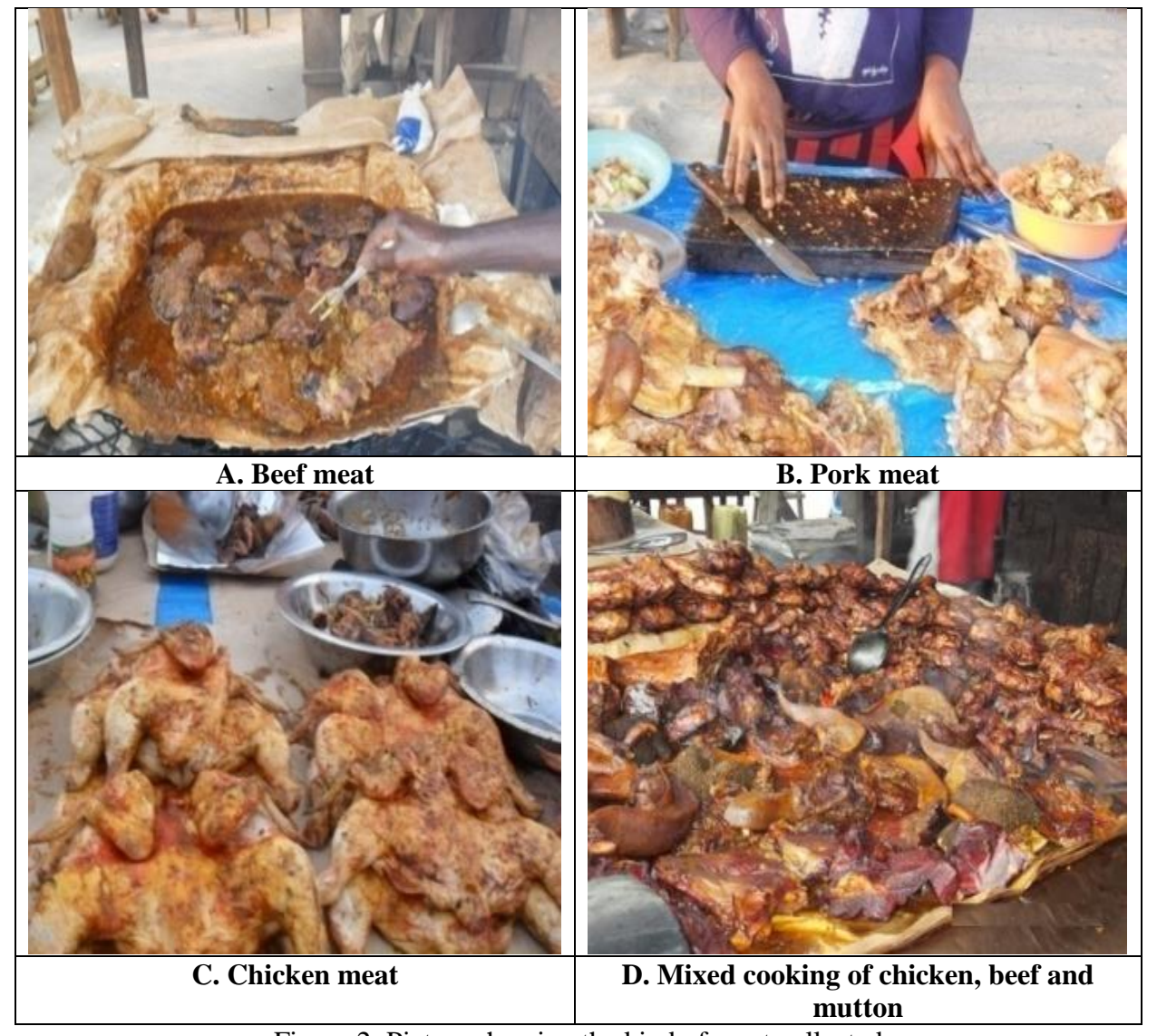
Figure 2: Picture showing the kind of meat collected