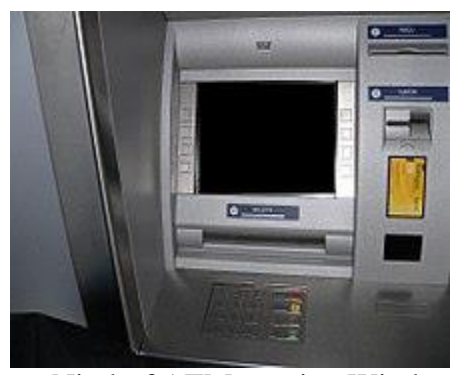
A Wincor Nixdorf ATM running Windows 2000

But let's focus our attention on the software where aspect of the ATM because that is what this research is all about. With the migration to commodity Personal Computer hardware, standard commercial "off-the-shelf" operating systems, and programming environments can be used inside of ATMs. Typical platforms previously used in ATM development include RMX or OS/2.