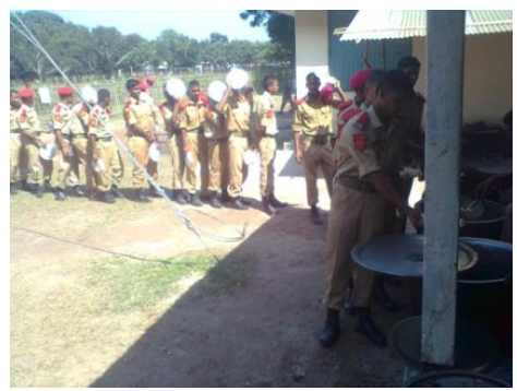
Plate 5: Waiting for food