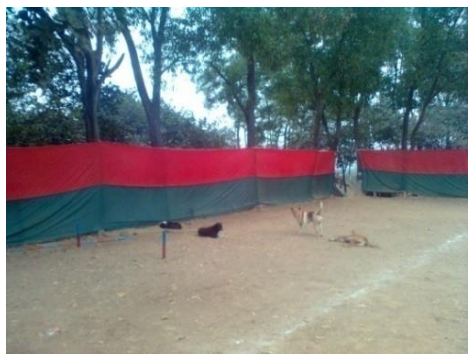
Plate 3: Animals are vector