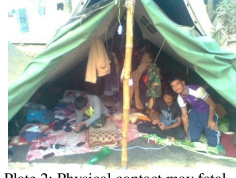
Plate 2: Physical contact may fatal