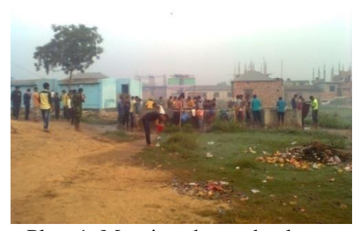
Plate 1: Morning shows the day