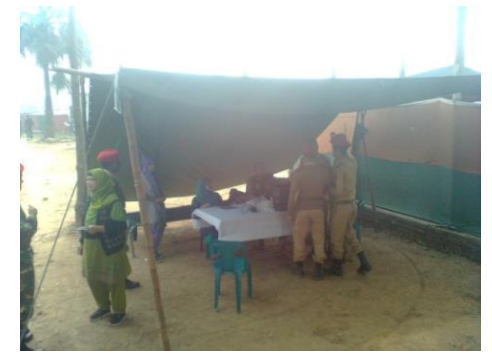
Plate 8. Medical camp