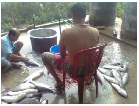
Plate 7: Raw fishes with blood