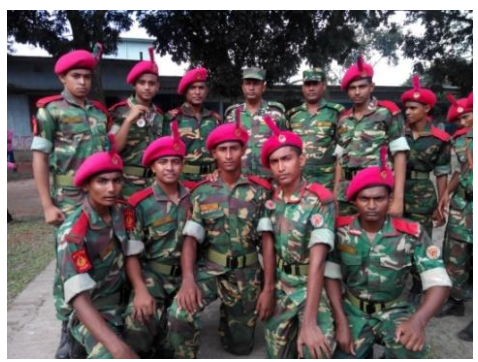
Plate 4: Adjutant and PUO (writer)