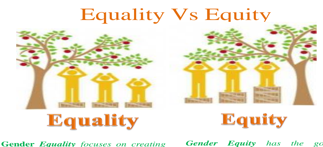
Gender Equity has the goal of providing everyone with the full range of opportunities and benefits – the same finish line

Gender equality means that the different behaviour and needs of women and men are considered, valued and favored equally. It does not mean that women and men have to become the same, but that their rights, responsibilities and opportunities will not depend on whether they are born male or female. Gender equality requires equal enjoyment of valued goods, opportunities, resources and rewards by women and men. It is generally women who are excluded or disadvantaged in relation to decision-making and access to economic and social resources in case of gender inequalities.