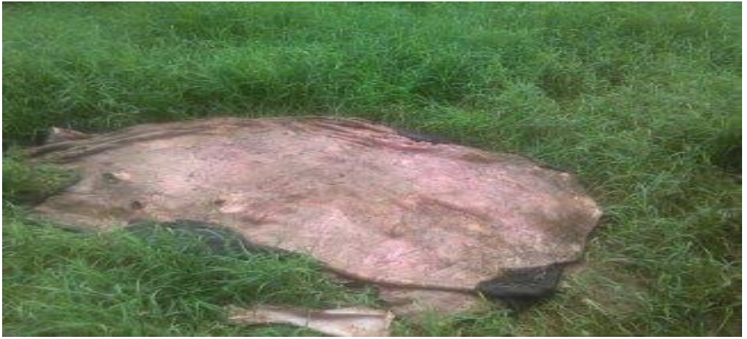
Figure 2: Ground air drying method in Lare Woreda

The distribution of hide and skin preservation methods in the study areas by respondents in all methods type is not on the same stage which was presented in table 5. The findings revealed that in all of the study area of hide and skins preservation methods higher variation was assessed. On the other hand, elongation capacity was within the standard range interviewer understanding for preservation of hide and skins to keep its quality.