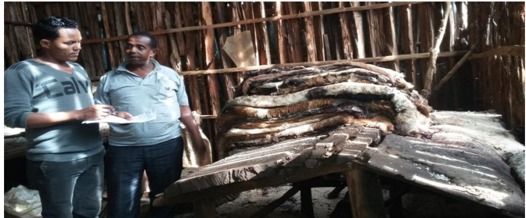
Figure 3: Preservation method and storage of sheep skin in Godare woreda skin storage place