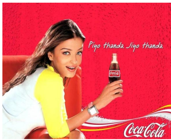
Print advertisement with single celebrity endorsement

Two created Print advertisements are given below: