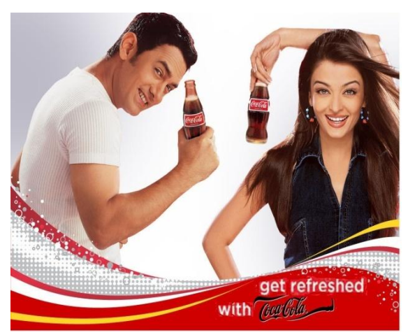
Print advertisement with multiple celebrity endorsement