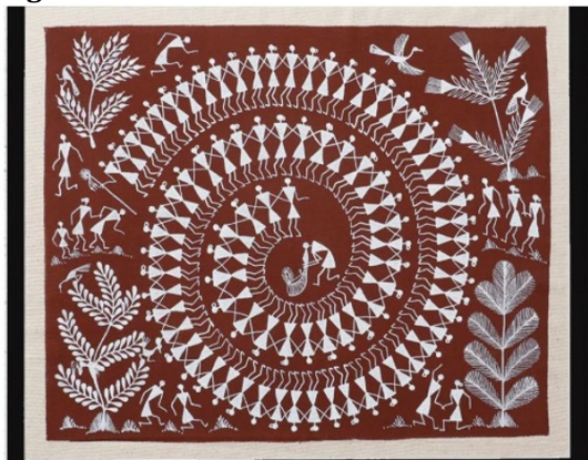
Figure 2 Warli Painting