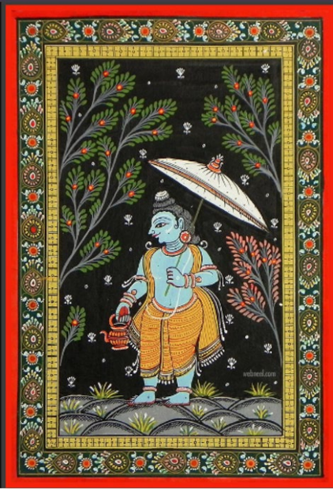
Figure 4 Pattachitra Painting- Folk and Tribal Art Odisha India