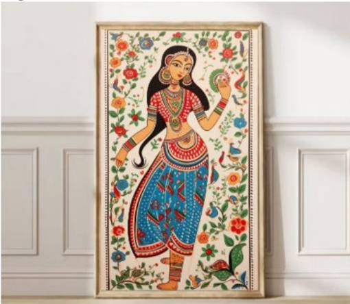
Figure 1 Madhubani Painting also known as Mithila Art

Source: Madhubani Painting, Indian Wall Art Print, Indian Painting, Indian Digital Folk Art, Indian Traditional Madhubani Art – Ets`y Denmark https://share.google/3kgUoEqNkwum3290v