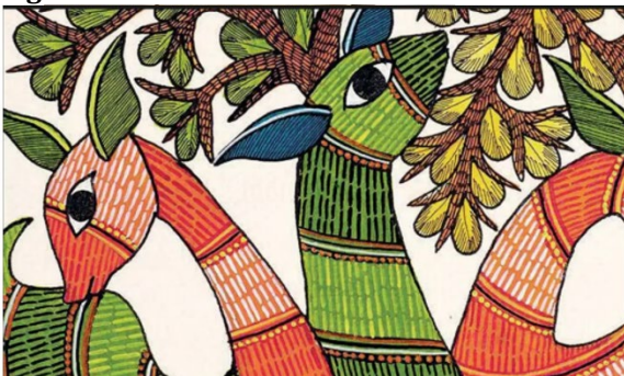
Figure 3 Gond tribes of Central India