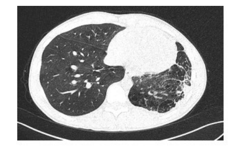
Figure 2 Axial Scans of the Chest CT Showing Lung Parenchymal Involvement

Before discharge, another respiratory functional test (body plethysmography) confirmed the presence of a moderate obstructive syndrome. (FVC = 82.4%; FEV1 = 63.9%; FEV1/FVC = 62.75; PEF = 75.1%; TLC = 114.6% (7.91 L))