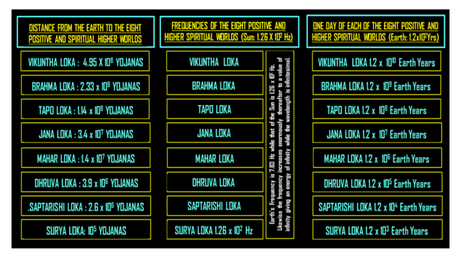
Figure 1 Distances to the Seven Higher Worlds with Corresponding Frequencies and Equivalent Earth Years

The panchabhutas are dissolved in the reverse sequence of their production, following the chakra system (wheels of energy) of Kundalini in a human being, analogous to DNA, extracting the soul from the base (muladhra) upwards in the final moments of death. At the point of death, subtle bodies (sookshma sarira) and souls have unlimited alternatives for their onward trip to the dimension that corresponds to how they lived their lives on Earth. According to the virtues of subtle body purity generated from one's life's activities, the subtle body rises to higher lokas, allowing one to enjoy the fruits of good actions, attain liberation, or be reborn. Liberation from enslavement is attained by an enlightened soul. Figure 1.