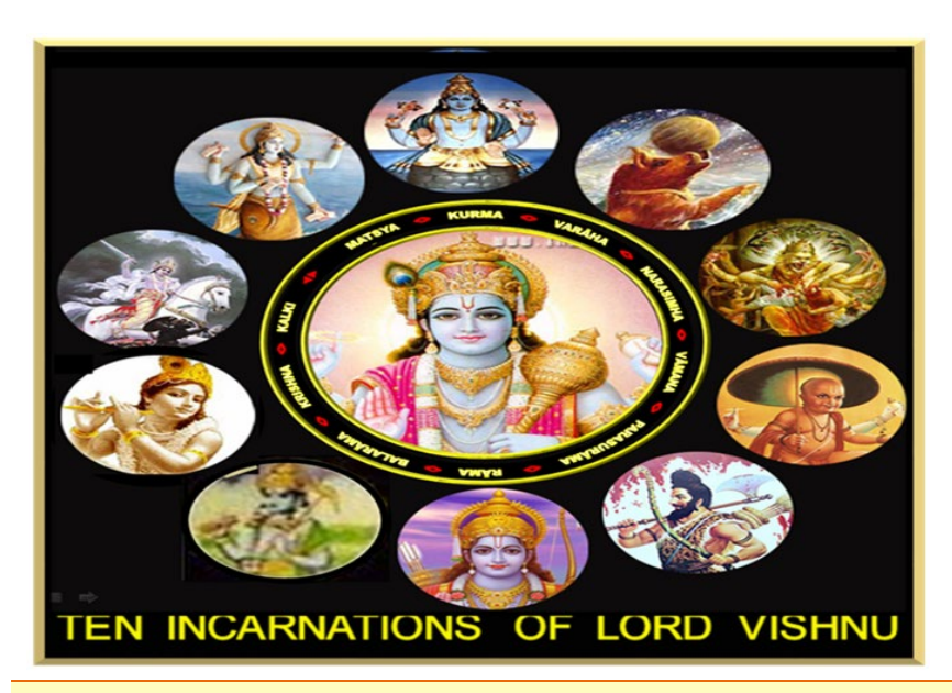
Figure 2 Ten Incarnations of Lord Vishnu