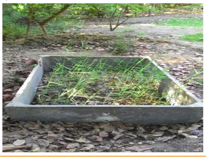
Figure 2 Plantation of reed grass in wetland