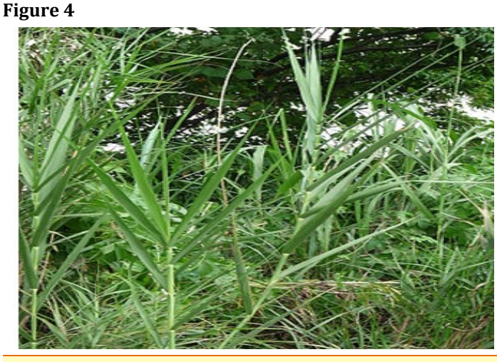
Figure 4 Reed grass (Phragmite karka)

Because the quantity of dissolved oxygen in the filtration beds is relatively low, organic compounds are successfully converted into simple compounds mostly by microbial degradation under oxygen-deficient or anaerobic conditions. Filtration and sedimentation are the primary methods for removing suspended particles, and the removal efficiency is usually extremely high. Denitrification is the primary nitrogen removal mechanism in HF CWs. Because there is constant soggy conditions in the filtration bed, ammonia removal is reduced. In HF CWs, phosphorus reduction is often low. The most essential functions of reed grass in HF CWs are - the provision of substrate (roots and rhizomes) for the growth of associated bacteria, radial oxygen loss from roots to the rhizosphere, nutrient uptake, and bed surface insulation from heat.