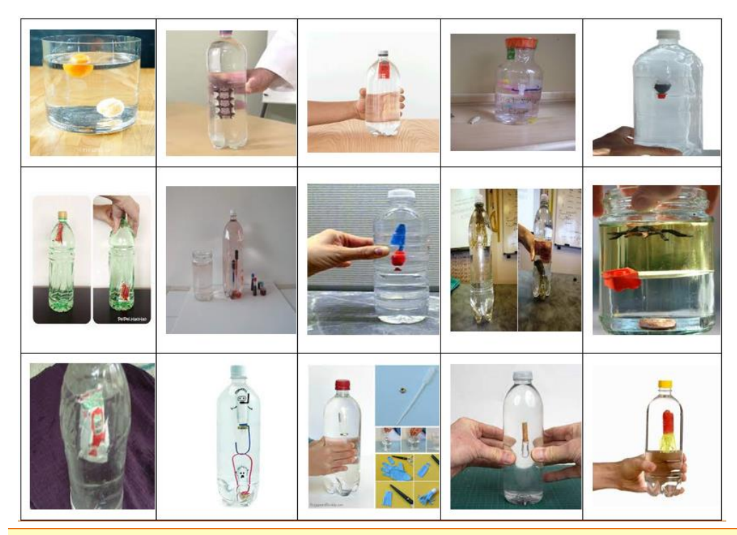
Figure 2 Reference Model