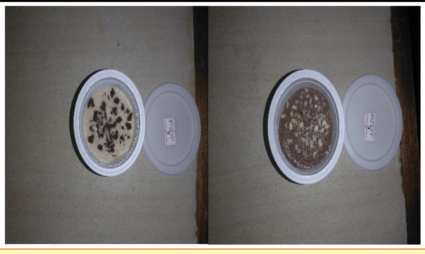
Figure 1 Vanilla flavored and Chocolate flavored frozen yoghurt

Frozen yoghurt samples were scored by 30 untrained panelists including the staff members and students of Faculty of Veterinary Medicine and Animal Science, University of Peradeniya. Appearance, taste, texture, sweetness and overall acceptance were assessed by the panelists. A five-point hedonic scale was used where 1=dislike very much to 5=like very much.