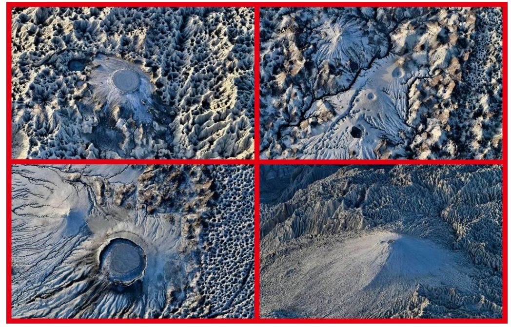
Figure 3: Signifies chandragup mud volcanoes and surrounding mudflows