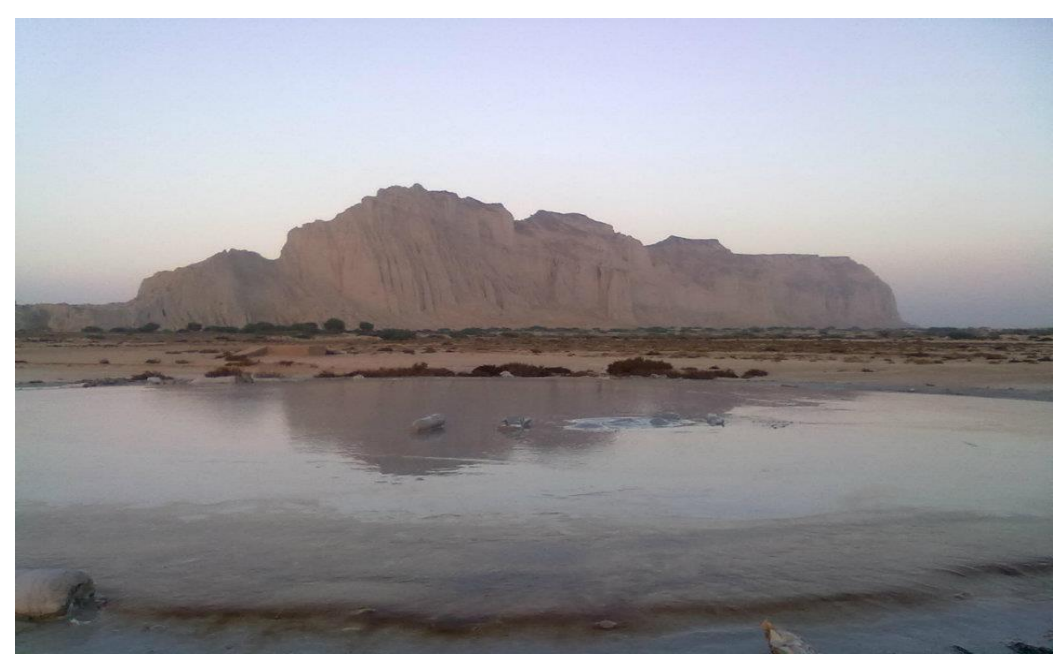
Figure 2: Illustrates a close-up view of Gwadar mud volcano.

It is located nearby Gwadar city (Delisle et al., 2002) (Fig. 2). The area sheltered by the focal mud volcano is approximately 0.11 ha and crater diameter ranges from 1 to 7 m. A total of two mud volcanoes have been recognized which exemplifies no activities (Kassi et al., 2013).