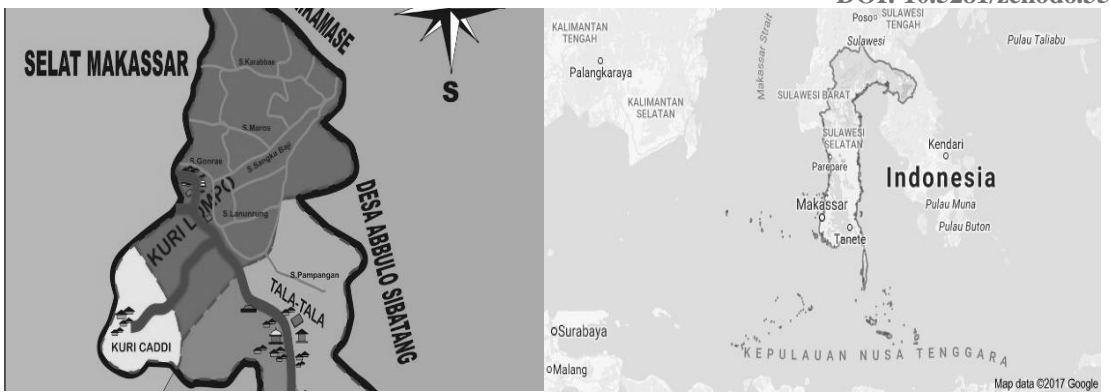
Figure 1: Map of Kuri Lompo in Makassar Strait