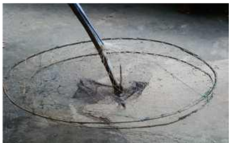
Figure 2. Fishing gear bubu

The tools used in this research were fishing gear bubu serves to catchs crabs, plastic bags for storing sample, preparatory boards for placing samples, sliding compass for measuring carapace width of crabs, digital scale 0.001 g to measure sample weights, and a camera for documentation. The sample used in this research is mangrove crab ( Scylla serrata ).