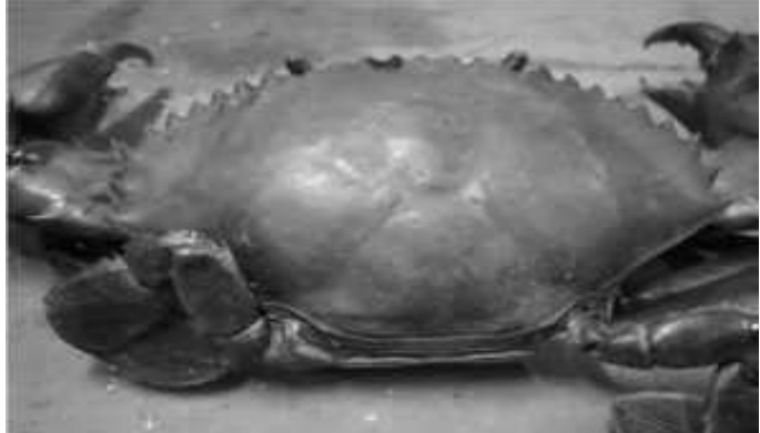
Figure 3: Measurement method; carapace width (1) and carapace length (2) of Scylla serrate

Determination of mangrove crab sexual is done by observing the shape of abdomen. The abdominal segment of male crab is tapered, while the female is wider. Female abdomen like stupa while male like pillar.