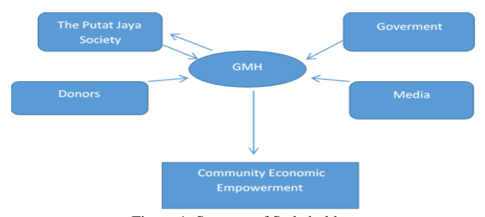
Figure 1: Synergy of Stakeholders

Synergy of Stakeholders in Economic Empowerment by GMH in Surabaya City