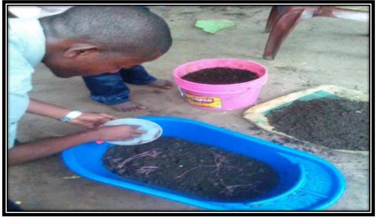
Face 9: Inoculation of 75g of the toward earth