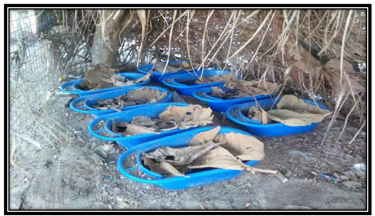
Face 8: Experimental device

The toward chosen earth are of type épigé (Lumbricus terrestris) collected in the plant matter in decomposition, notably to the surface of soil to our experimental site.