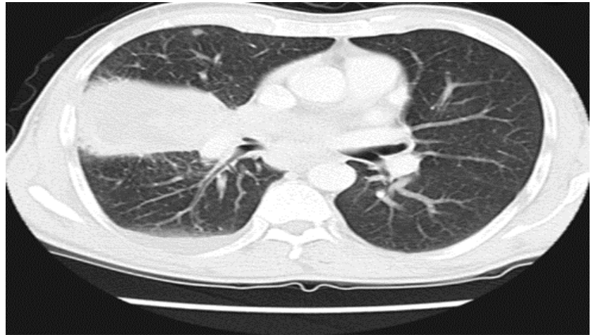
Figure 3: Axial CT scan shows large cell carcinoma