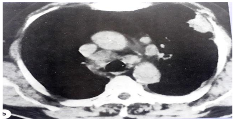
Figure 1: CT Scan adenocarcinoma