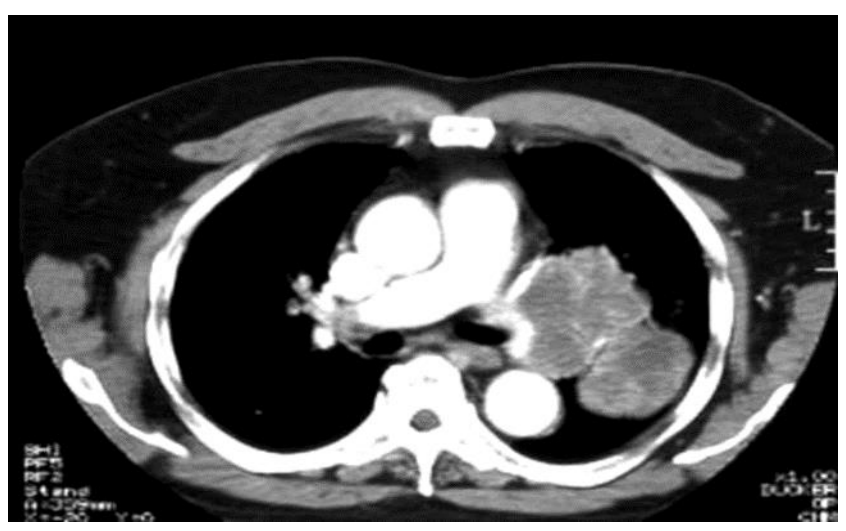
Figure 4: Shows Small cell carcinoma