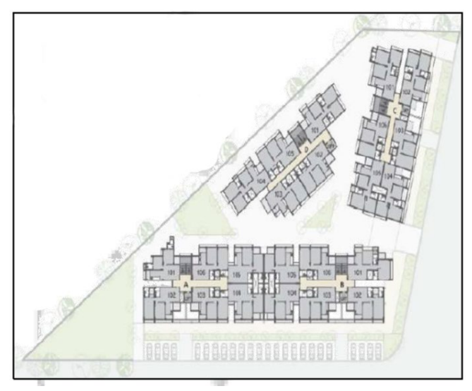
Typical layout of site plan [12]

The information regarding the project was collected by the researcher through the technical team of the project which was involved in various activities of the project.