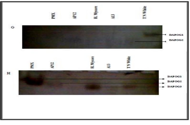
Figure 1: Native-PAGE of the Phenoloxidase using Dopamine substrate in haemolymph of five selected silkworm races of Bombyx mori (L.). (A) Control, (B) LPS -treated haemolymph samples.

Fig.5.34. Native- PAGE of the phenoloxidase using L-DOPA substrate in midgut of silkworm races of Bombyx mori (L.). (G) Control, (H) LPS-Treated.